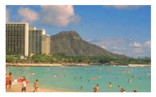
The Hawaiian mountain called Diamond Head.

Hawaii is nicknamed "the Aloha State." Aloha is a word in the Hawaiian language meaning peace, love, or affection. It is often used as a way to say, "hello" or "goodbye." Hawaii is like the word aloha, because it is a state that has two viewpoints: it remembers its history and looks toward the future.