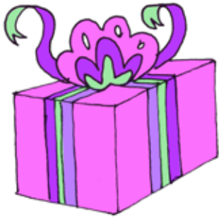
present or gift