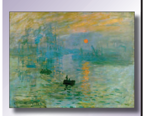
Impression, Sunrise, Claude Monet, 1872

Three major movements in the history of art are Medieval. Renaissance and Modern. The Medieval period, which encompasses the time from around 600 AD into the 14th century, is predominately religious in nature. Objects are not portrayed realistically, but as simple flat images. During the Renaissance period, beginning in the late 14th century and continuing into the 16th century, artists developed a more realistic style. Renaissance artists also discovered the use of perspective, which brought a three dimensional feeling to two dimensional artwork. Prominent artists of this time were Leonardo da Vinci and Jan van Eyck. Modern art, which encompasses the Impressionist and Cubist movements, began in the late 19th century and through the 20th century. Rather than focusing on realism, artists explored the use of light, movement and color. Modern artists include Pablo Picasso, Claude Monet and Vincent van Gogh.