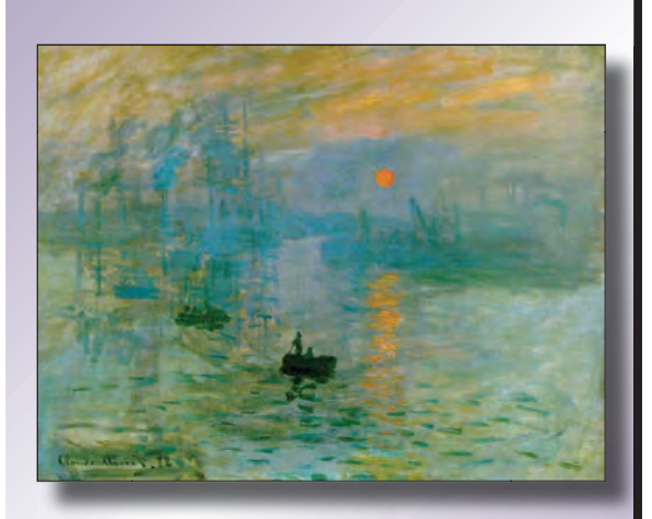
Impression, Sunrise, Claude Monet, 1872

Three major movements in the history of art are Medieval, Renaissance and Modern. The Medieval period, which encompasses the time from around 600 AD into the 14th century, is predominately religious in nature. Objects are not portrayed realistically, but as simple flat images. During the Renaissance period, beginning in the late 14th century and continuing into the 16th century, artists developed a more realistic style. Renaissance artists also discovered the use of perspective, which brought a three dimensional feeling to two dimensional artwork. Prominent artists of this time were Leonardo da Vinci and Jan van Eyck. Modern art, which encompasses the Impressionist and Cubist movements, began in the late 19th century and through the 20th century. Rather than focusing on realism, artists explored the use of light, movement and color. Modern artists include Pablo Picasso, Claude Monet and Vincent van Gogh.